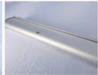
EXTRA WIDE 1200mm