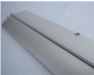
REINFORCED POLE SUPPORT